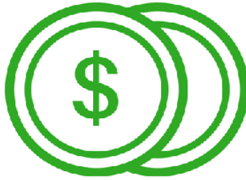
Budget Development 2019-20